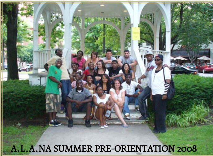
A.L.A.NA SUMMER PRE-ORIENTATION 2008